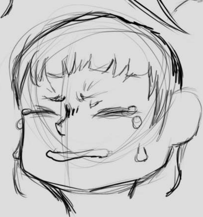
Emory - Biochemist, she grown up in a dystopian world, lost her arm in an explosion