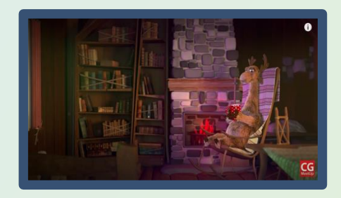
"Hey Deer!" Award Winning Animated Short Film