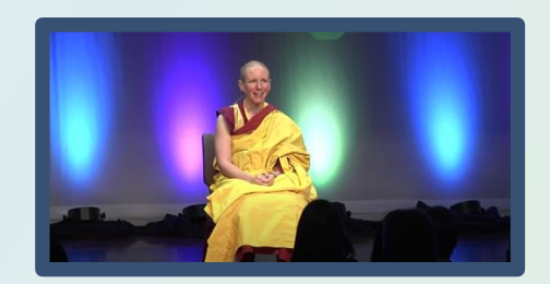
Happiness is All in Your Mind