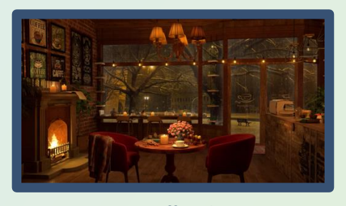
Cosy Coffee Shop