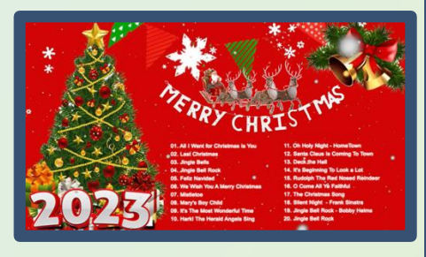
Top Christmas Songs of All Time